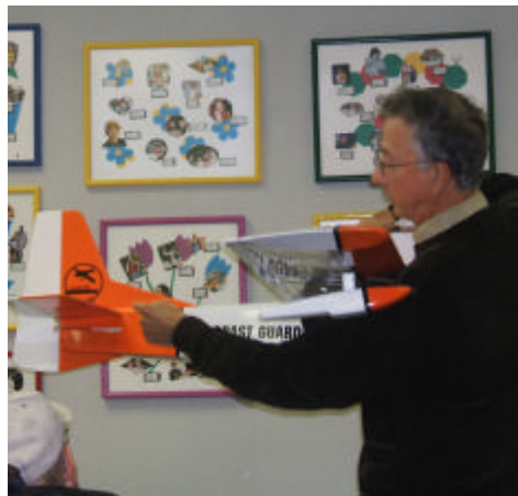
... and his float plane