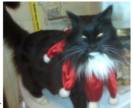
Tuffy the cat doesn't like dressing up for the holidays!