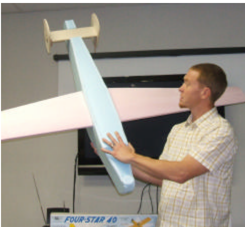
Fun with foam